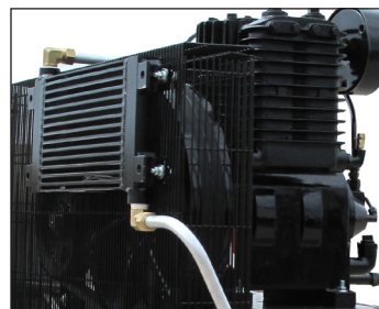
Air cooled after cooler Elite unit