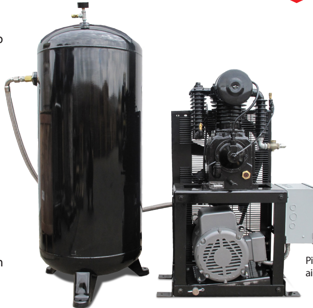
Pictured with optional air storage receiver