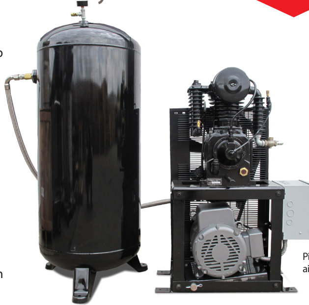
Pictured with optional air storage receiver