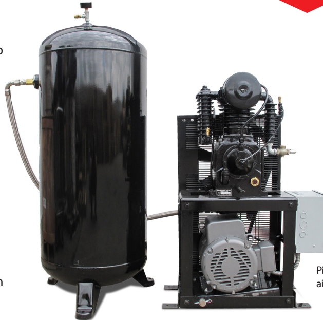
Pictured with optional air storage receiver