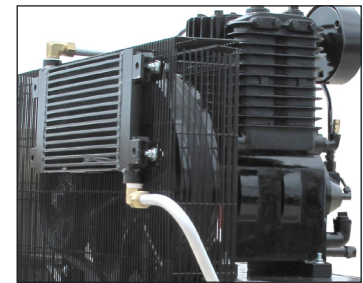
Air cooled after cooler Elite unit