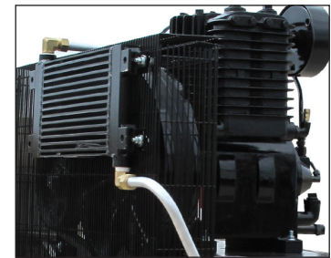
Air cooled after cooler Elite unit