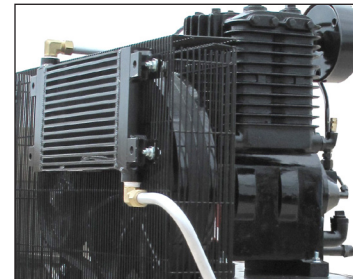
Air cooled after cooler Elite unit