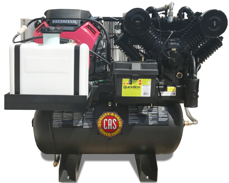
Shown with optional fuel tank