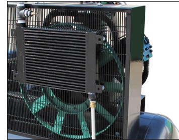
Air cooled after cooler Elite unit