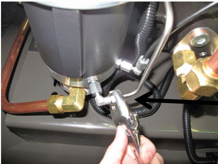
Loosen nuts on scavenge line

ALWAYS MAKE SURE POWER IS OFF TO COMPRESSOR AND CONTACT FACTORY AUTHORIZED SERVICE CENTER OR FACTORY FOR ADVICE